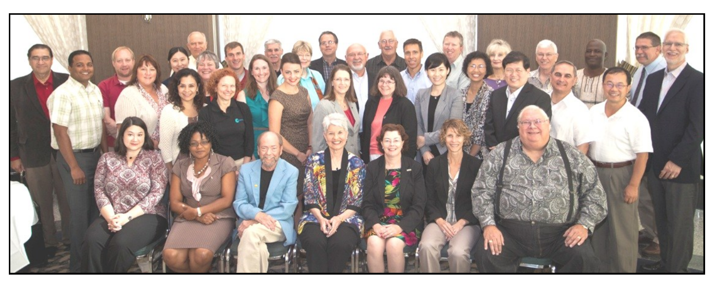
IAFP Affiliate Council Meeting, July 22, 2012.